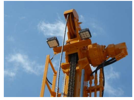
Head Shieve with Light