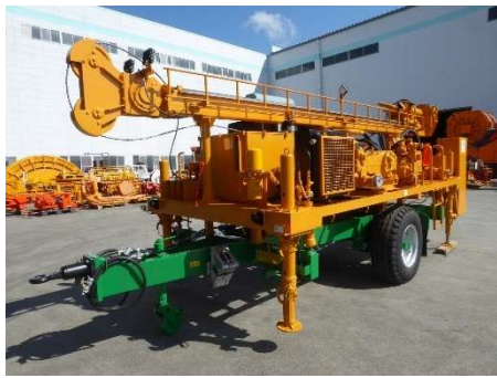
Trailer Mounted Type