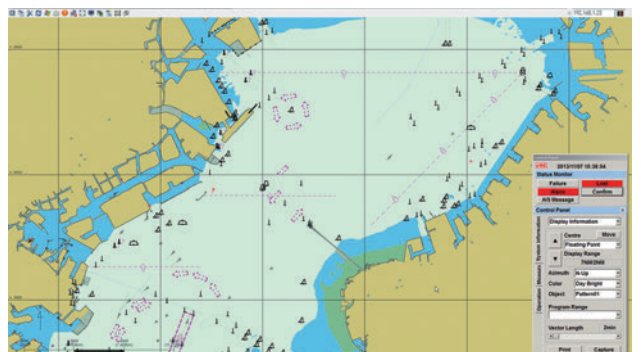
ENC display screen of optional operational display

This VTS model is designed as the compact system consisting of an antenna, a processor unit and an operation unit, which is suitable for surveillance of a relatively small sea area of approximately 10 to 15NM. An operation display is also available as option to display an accurate electronic navigational chart (ENC S63).