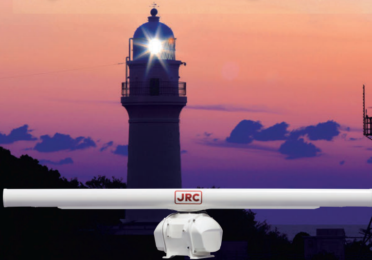
9-foot X-band 25kW antenna

If you choose cost performance, it's V600!